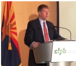
Richard Cordray, Director, Consumer Financial Protection Bureau, speaks to housing counselors.

We created the Down Payment Assistance Program Guide with information on over 30 first-time homebuyer down payment assistance programs across the state.