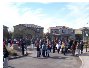
Quality, affordable homes.