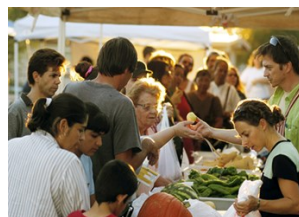
Healthy food access.

Home Matters® is a national movement uniting America around Home. Visit HomeMattersAmerica.com .